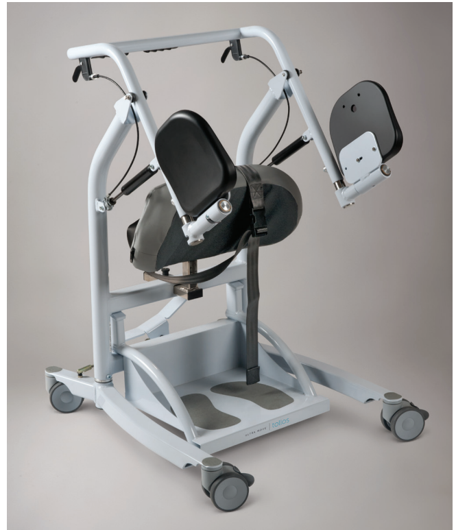
The Ultra Move is a non-electric device offering a safe way to transfer patients that require minimal assistance.