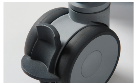
The device features a sleek, space-saving design and is easy to move or break with easy roll casters.