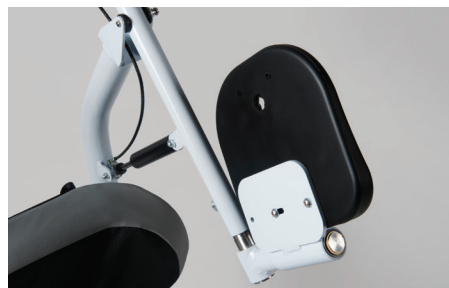
The seat pads are swivel into place so that the patient can comfortably sit during the transport.