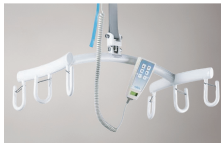
Our true six-point spreader bar, with optional locking carabiner clips, allows for maximum patient safety and can be used for effective in-bed repositioning - a task that older, two-point spreader bars just cannot effectively perform.