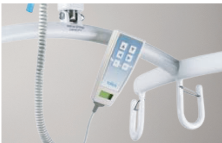
Optional wireless hand control - access all iQ Technology™ with convenient digital hand control.